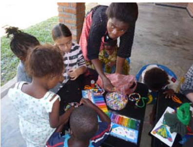
Threading exercises with learning toys freshly unpacked