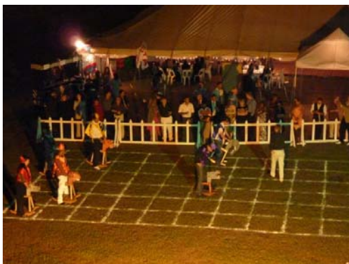
Race in Progress. The Namitembo Classic